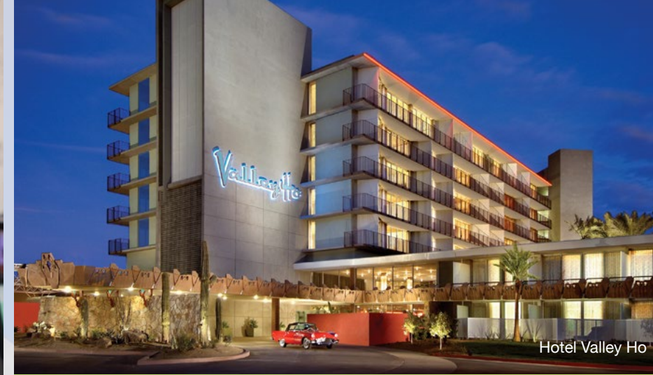
Hotel Valley Ho

Arizona has made a concerted effort in recent years to create a business-friendly environment by cutting red tape and repealing overly burdensome regulations that would otherwise make business more difficult for innovative firms.