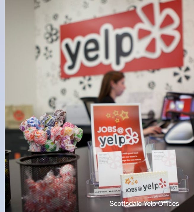
Scottsdale Yelp Offices

Not only are there great companies in our community, region and state, but collaborative ecosystem resources such as AZ Tech Council, EmpoweredPhXX, StartupAZ Foundation, InvestSW, Phoenix Startup Week and #yesPHX are advancing initiatives and connecting thought leaders. These resources are just a glimpse into what is available for an entrepreneur looking to scale operations in Scottsdale and join a thriving, diverse and generous community.