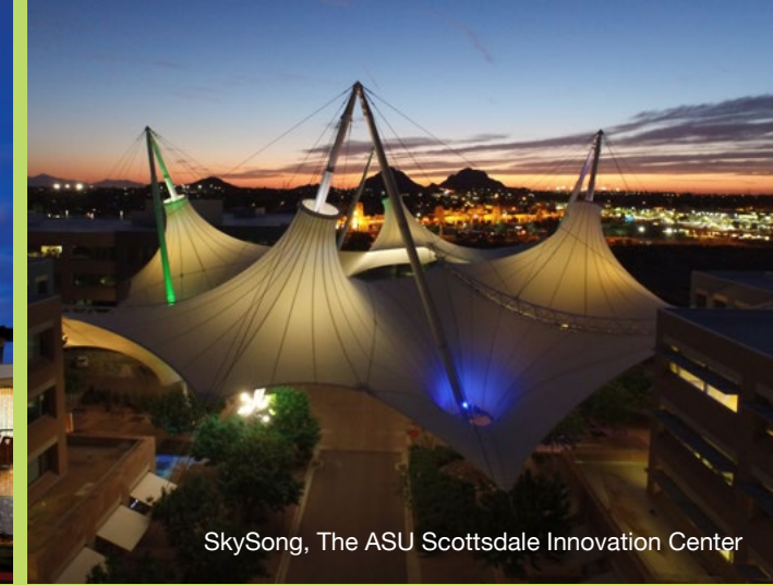
SkySong, The ASU Scottsdale Innovation Center