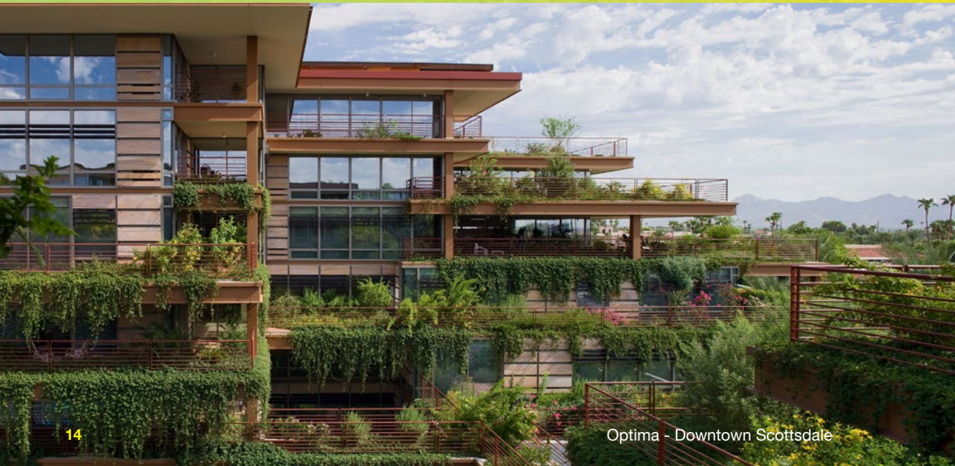
Optima - Downtown Scottsdale

Generally, Scottsdale has been better insulated to market events/changes over time compared to other Valley cities. Scottsdale is a community that is no longer sprawling compared to other valley communities, and is now cycling to a redevelopment phase with multi-family housing being the strongest market. The multi-family developments in Scottsdale provide housing that satisfies contemporary preferences for unit finishes and community amenities in desirable locations.