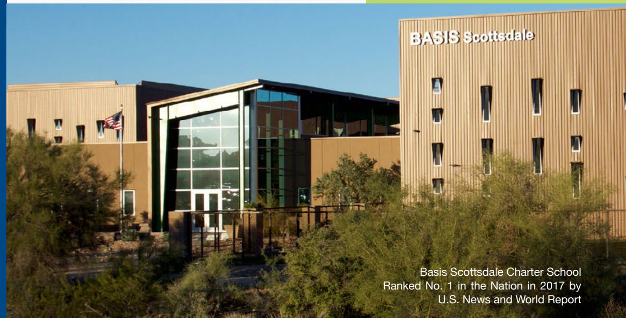
Basis Scottsdale Charter School Ranked No. 1 in the Nation in 2017 by U.S. News and World Report

Scottsdale and the Greater Phoenix metro area offer many smaller colleges and specialized institutions with virtually unlimited options to continue your educational growth or to ensure your children receive the highest education possible.